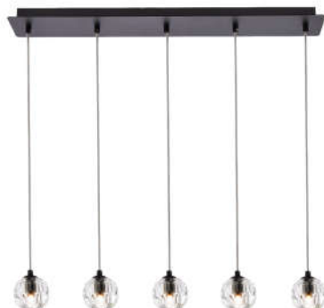
Black Item No:3505D32BK