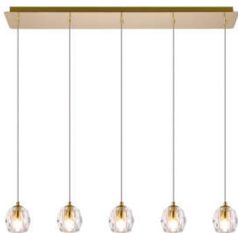
Gold Item No:3505D32G